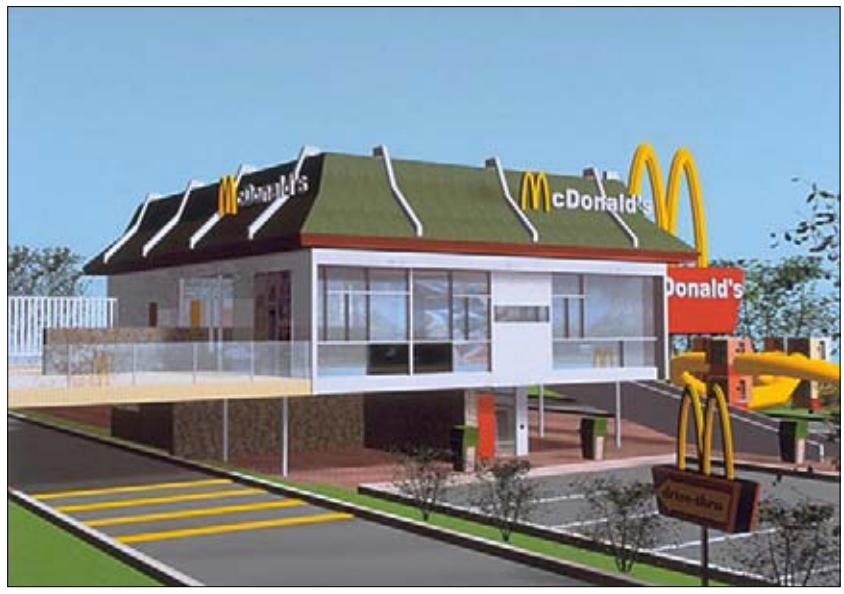
79 \times 103 \text{ cm}

7. Callum Morton, Australia, Mac Attack , Wahroonga , NSW , 2001, digital print – Auto Cad, 3D Studio max, Illustrator, Photoshop, edition of 30