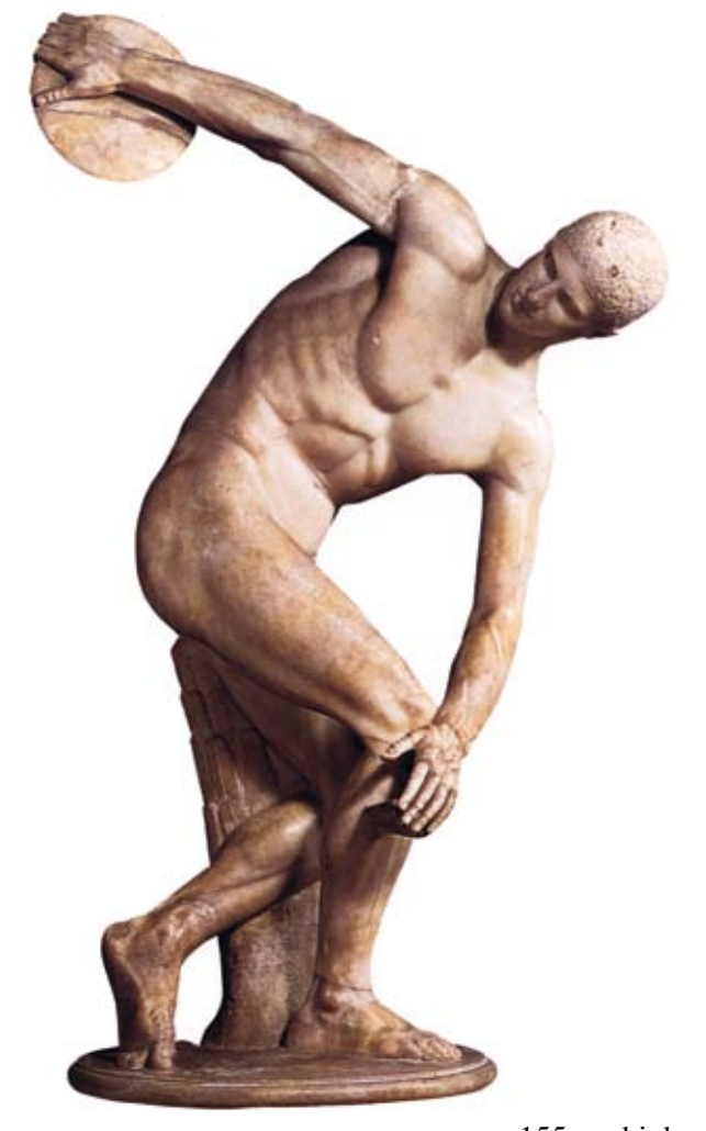
155 cm high

Wearable Art: Design for the body, ed. Naomi O'Conner, Nelson: Craig Potton Publishing, 1997.