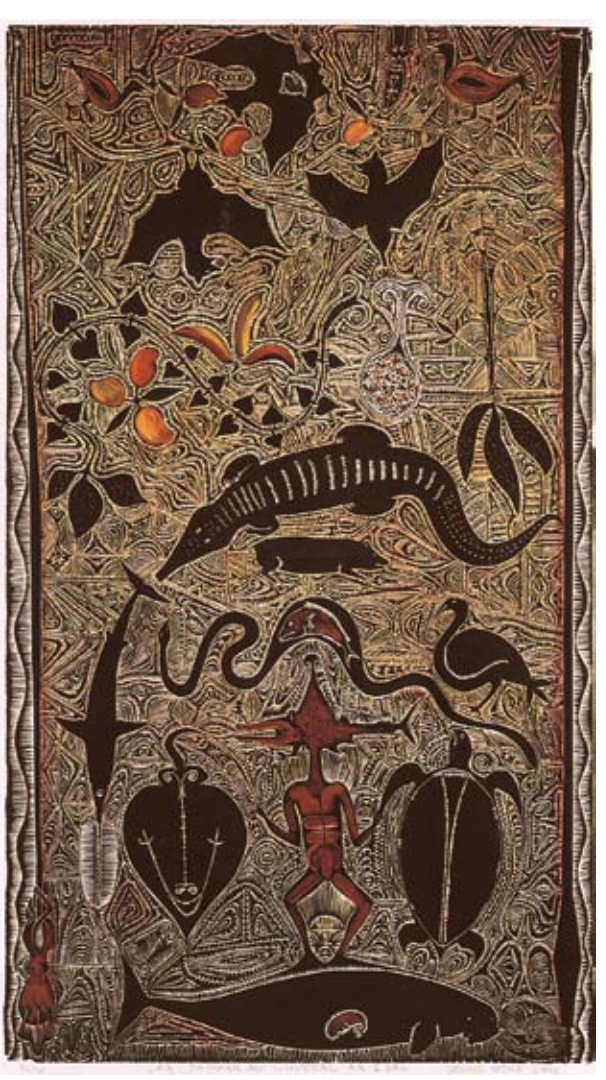
87 \times 50 \text{ cm}

3. Margaret Dodd, Australia, Holden with lipstick surfboards , 1977, handbuilt, glazed earthenware National Gallery of Australia, Canberra, purchased 1981