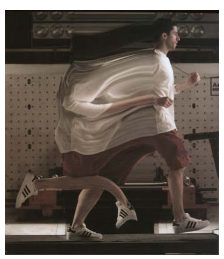
6. Daniel Crooks, New Zealand/Australia, Static Number 11 ( man running ), 2008, production still, 04:32 min, single channel HD/BluRay, stereo, edition of three Courtesy of the artist and Anna Schwartz Gallery