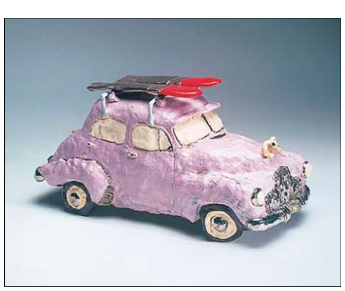
21 \times 44 \times 20 cm

1. Pablo Picasso, Spain/France, Woman with hands joined , 1938, charcoal and pencil on primed canvas