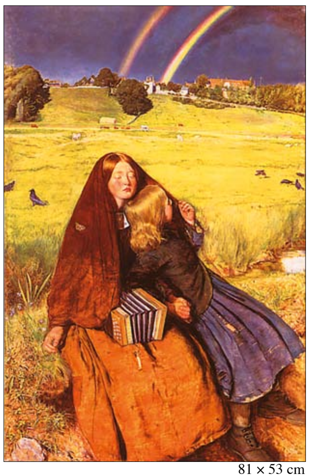
4. John Everett Millais, England, The Blind Girl , 1854, oil on canvas